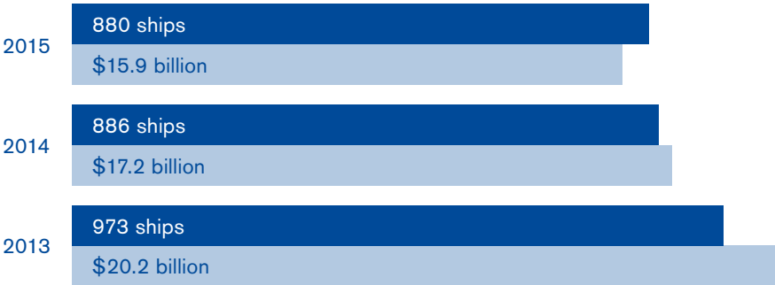
All figures as of 20 February 2015

The table below compares the number of ships entered in the Association and the total entered value over the last three years.